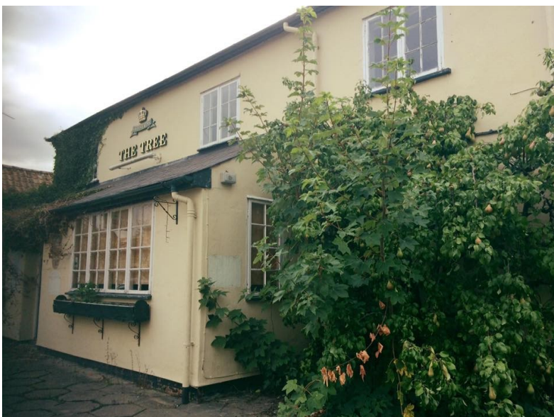
The Tree, August 2017

Meanwhile, a decision has not been made on the planning application on the site of The Tree.